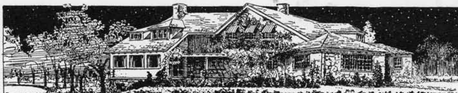
3 Lakeview Ter. Winchester, Mass.